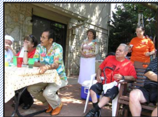
Wow, can they play!