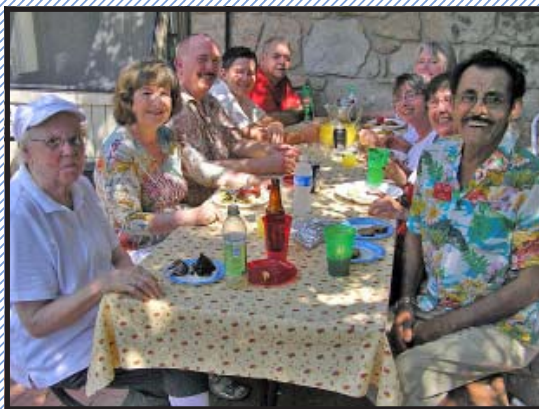
The whole gang enjoying food and fun!