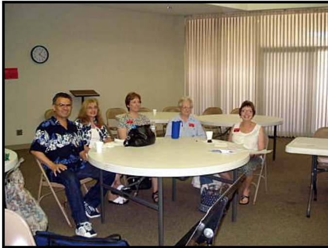
Members listening to the performances