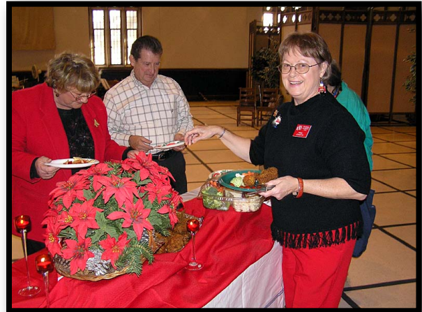
Friendship, fellowship, smiles