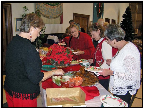
We shared friendship