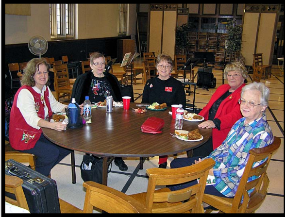
Members and friends from Tulsa