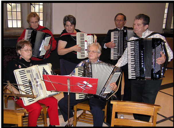
Music time together