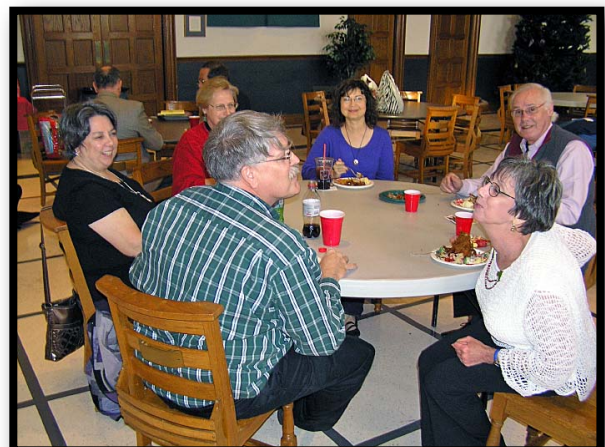
Smooches across the table