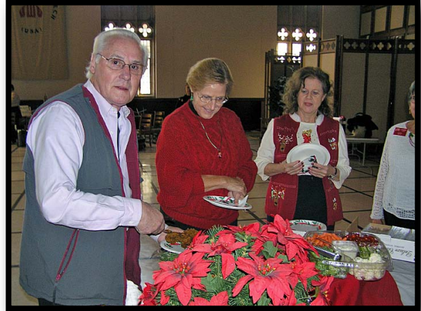
We had lots of wonderful food