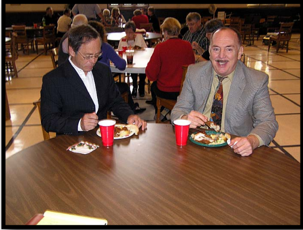
Common thoughts and togetherness