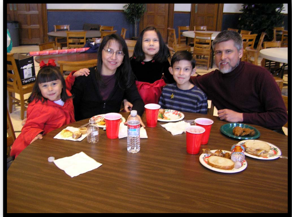
Family time together